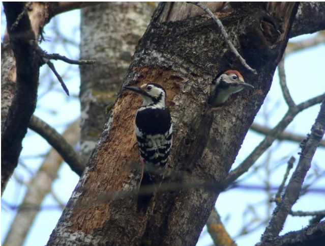
White-backed Woodpeckers (digiscoped)

Arek suggested a 4.45 start, and eager to take advantage of the dawn we made sure we were ready when he arrived on his bike at sparrow-fart. We began with a quick drive around the village and then through Teremiski hoping that some Bison were out in the fields, but there was no sign so we carried on to our first main site, just south off the main road to Hajnowka (Zielony Tryb). A short walk into the forest with Wood Warblers singing every which way included some great views of this lovely Phyllosc , but we could hear a woodpecker calling and didn't pause for photos. Arek pointed out a hole high up in a dead tree and within a few minutes the protruding head of an almost fully grown male chick was filling our scopes, and soon after a female White-backed Woodpecker visited