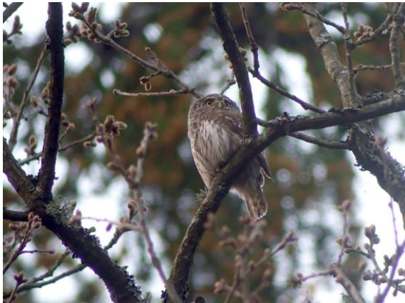
Pygmy Owl (digiscoped)

Dinner was very tasty and around 7.15 we were met by Arek, whom we had booked to go looking for Pygmy Owl this evening. We drove a short distance out of the village then south onto a track (Sinicka Droga) before pulling up in a parking spot near the old railway line. Walking deeper into the forest (and encountering our first of the mosquitos that were to make life uncomfortable for the next few days) we immediately heard the