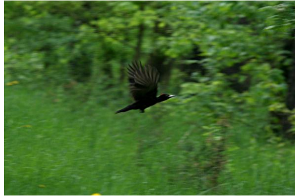
Black Woodpecker (DSLR)

The last few km of the side road from the village to the main road of the 65 to Grajewo passes through nice looking pine forest. As we entered the forest we noticed another roadside bird and realised we had just passed another Hawfinch . We reversed and I managed a poor record shot before it flew, but we now drove on more circumspectly and found another few Hawfinch and well as at least one Siskin and then a larger bird that we realised was, unusually, a Great Spotted Woodpecker , and another on the other side of the road. Peering through the grubby windscreen I was irritated when a crow flew down to obscure my view of the woodpecker when Tom took a second look – shit, it's a Black Woodpecker ! Finally laying to rest this bogey in unusual circumstances was a highlight of the afternoon. I managed only a couple of poor pics of this impressive bird on the deck and in flight. We tracked it through the forest and Tom got an angle to take a quick picture on a tree trunk (obscured for me) before it disappeared into the forest and could not be coaxed back by Tom's iphone.