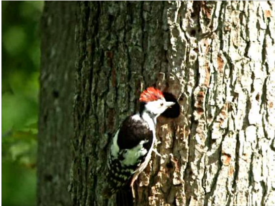
Middle-spotted Woodpecker (videograb)

We now returned to the bridge near Budy to stake out a fresh-looking nest hole we'd seen that Lukasz confirmed was occupied by a pair of Middle-spotted Woodpeckers. We stationed ourselves quietly with a decent view of the hole and waited. Soon after we saw some movement in the hole,