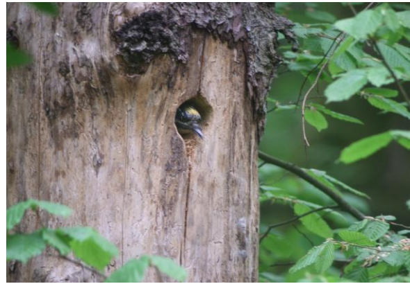
Male Three-toed Woodpecker, Strict Reserve (digiscoped)