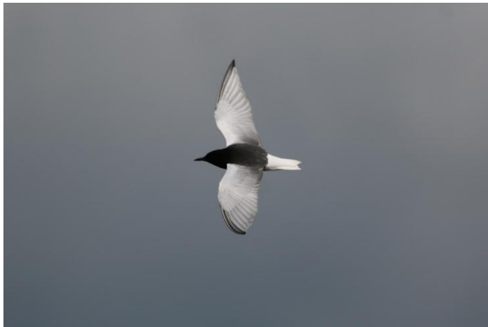
White-winged Black Tern (DSLR)

After another hearty breakfast we packed up, settled with Zenon and headed north along the west bank, retracing our steps from the previous evening. Thrush Nightingales were surprisingly thin on the ground throughout the trip, only just arriving back, so when we heard one singing close to the road as we drove through Mocarze I pulled over and we spent some time trying to locate it in some