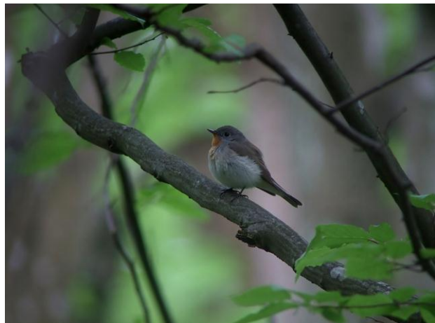
Red-breasted Flycatcher (digiscoped)

Dead Forest (site 26) and Arek suggested this