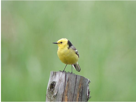
Citrine Wagtail (digiscoped)

Next stop, between 3 and 5pm was Msichy, another well-known Aquatic site, but with that in the bag a quarry here were Bluethroat and Citrine Wagtail. Though fairly sure we heard the former, we saw none, but in contrast two Citrine Wagtails performed beautifully, ably supported by a cast of