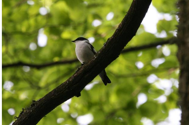
Collared Flycatcher (DSLR)

The very comfortable and highly recommended Wejmutka Inn was our base for the next two nights. We settled into our rooms then took a stroll through the palace gardens immediately opposite the hotel. Various common warblers were singing away in the late afternoon, the least “British” of which was a Great Reed Warbler . We added various other common species but were keen to see at least one of our targets before our dinner back at the hotel, which we had booked for 6pm. Fortunately in a more wooded area we found a cracking male Collared Flycatcher which obliged for our first photographs of the trip. Another posed on the fence near the main entrance to the park as we departed.