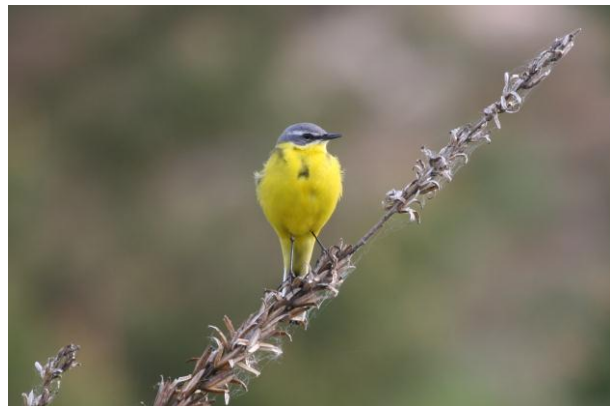
Blue-headed Wagtail (DSLR)

With bins we could see a number waders including a few Ruff, but our progress in the car which we had hoped to use as a hide was blocked by flooding across the track. We decided to try and approach carefully on foot. As water rushed into my boots I suppressed a gasp and the cursing that accompanied the realisation that my repair job with silicon sealant had been totally unsuccessful, and that a perfectly suited pair of wellies were in the boot of the car. Too late now. Unsurprisingly we could not approach very closely on foot, but crouching and squatting on the water-logged ground we settled uncomfortably to enjoy the spectacle. 5-6 superb summer plumage male Ruff and several Reeve were wandering about feeding, along with Dunlin , Grey Plover , Spotted Redshank (all in smart summer plumage), Wood Sandpiper , and marsh terns -- hundreds of White-winged Black Terns , along with smaller numbers of Whiskered and Black . Occasionally one or more of the male Ruff would get excited, puff out their ruff and wings and strut about. Wicked!