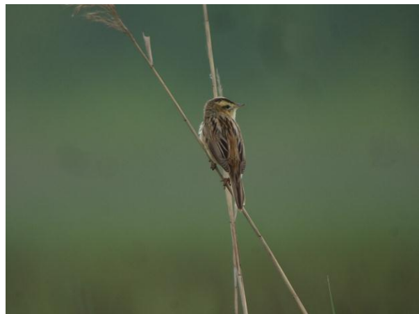
Aquatic Warbler (digiscoped)

The drive up the Czar's Rd took us through the bog alder forest. We stopped once or twice but observed few birds here, and no new ones, eventually reaching the famous Długa Luka boardwalk at about 12.30. Our plan was to be back here for late evening for the Aquatic Warblers for which this site is famous, but we decided on a midday recce. Half way along snatches of song peaked our interest and amazingly a scan across the grass yielded superb, if slightly distant views of a beautiful Aquatic Warbler . It sang from the tallest reed about a foot above the grass for several minutes allowing study in the scope, pictures and videos. Bloody beauty. Though we now had this in the bag we wandered to the end of the boardwalk where we saw at least two more birds, allowing comparison with the Sedge Warblers that were also present in some numbers. Also present were drumming Snipe , singing Curlew (heard only), Reed Bunting , and a very distant Elk on the edge of the forest some 2km away.