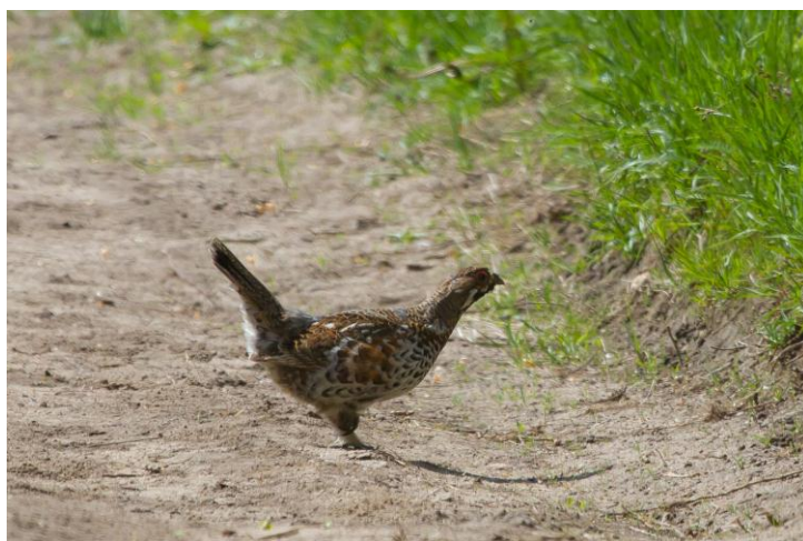
Hazel Grouse at Wysoki Bago