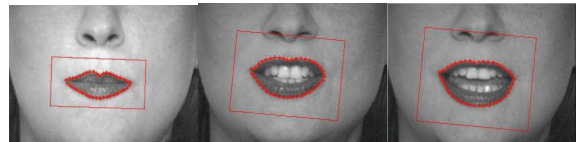
Figure 1. Three different snapshots taken during a speech with the rigid (rectangle) and non-rigid (lip contour) annotations. From left to right, the lip stages are: close, semi-open and open.

Different techniques have been proposed for lip tracking. However, the majority of the methods are not suited for an accurate lip segmentation when the image conditions ( e.g. illumination, texture) changes over time. For instance, deformable models [1] use a prior information about the foreground and background, which is potentially unreliable since the image conditions can vary over and between sequences. Optical flow provides good performance in tracking tasks [4], but its constraint can be violated in situations where changes are caused by the appearance (and not motion). Methods based on active shape models (ASM) [2] do not provide the best results in situations containing non-rigid and large textures changes. The Flexible Eigen-tracking [3] extends ASM to handle large non-rigid lip deformations, but the lack of more powerful dynamical models may represent a problem. Tracking non-rigid visual objects using particle filtering has produced excellent results [9, 13], but the main focus has been on formulating low-dimensional state spaces, which is an important problem, but orthogonal to what is proposed in this paper.