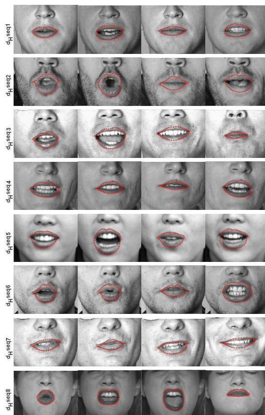
Figure 5. Results obtained with the tracking method introduced in this paper. The quantitative result for each row is shown in Tab.1.